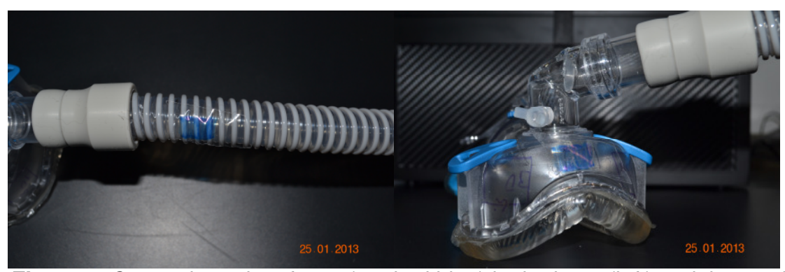
Figure 4 : Contaminated surfaces (marked blue) in the hose (left) and the mask (right).

The mask and the hose were contaminated by an Enterococcus faecalis (ATCC 29212) cell culture solution (Fig. 4). The contaminated surfaces of the mask were examined by swab testing after one sanitizing cycle within the SoClean. A directly contaminated swab was used as reference.