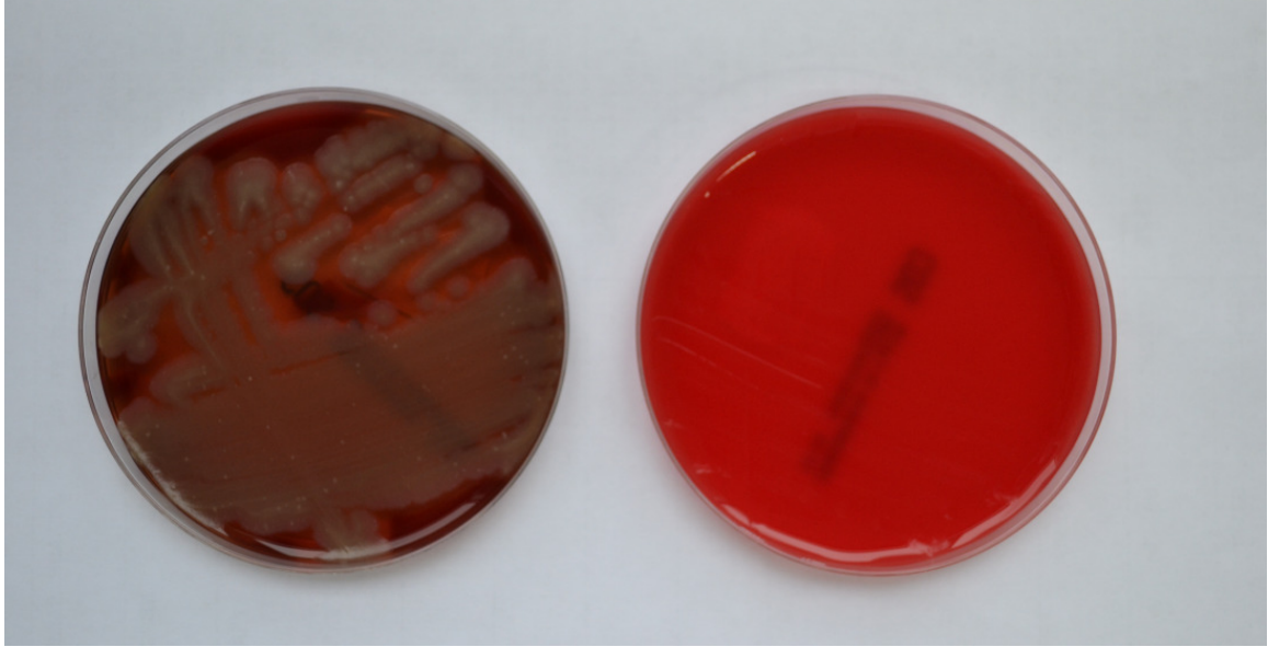
Figure 1 : Result of the swab-test before (left) and after (right) one sanitizing cycle with SoClean.

After one sanitizing cycle no bacteria and fungi could be detected (Fig. 1).