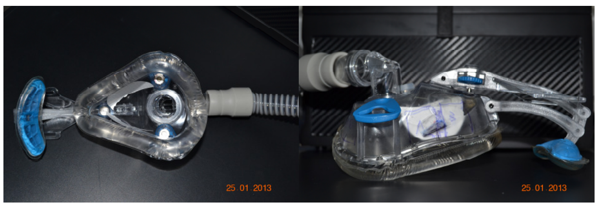
Figure 2: Positioning of the contaminated filter papers in the mask.

A reference cell culture of Enterococcus faecalis (ATCC 29212) was diluted 1/10 with sterile water. A membrane filter paper (0.45μm, Whatman, ME25) was contaminated with the bacteria by normal filtering. Each filter was separated into two parts. One part was positioned within the CPAP-mask (Fig.2), the other part was used as reference and was stored outside the incubation camber during the sanitizing process. After one standard cycle the filter was directly placed on a culture medium (Slanetz and Burtley, Oxoid, P05018A) and incubated for 60h at 37 °C.