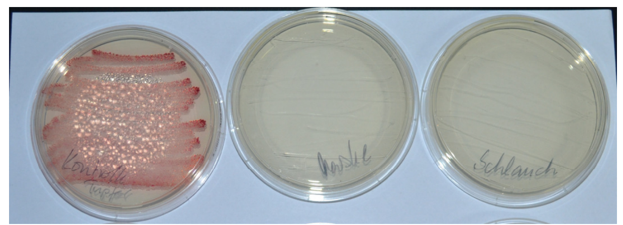
Figure 5 : Result of the swab-test. Reference (left), mask (middle) hose (right). The red colour indicates the presence of bacteria. The white colour indicates complete elimination of the bacteria.

On the contaminated surfaces all bacteria were inactivated (Fig. 5).